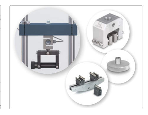
Solid and flexible fixing options for many terminals and accessories from the SAUTER product range, see accessories on page 35 et seq.