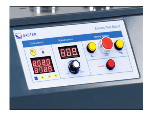
Premium operating panel

Test stand with electric motor for standard measurements