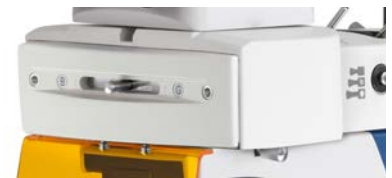
OBN 141/OBN 147

Semi apochromatic objectives available as accessories (see model outfit list Page 25)