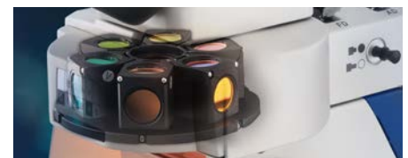
Sextuple filter wheel OBN 148