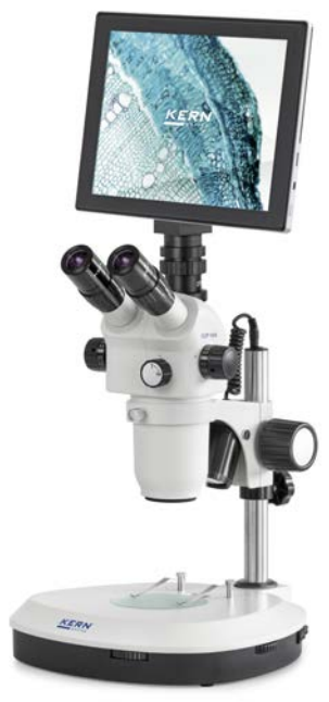
OZP-5 with tablet