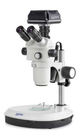
OZP-5 with camera