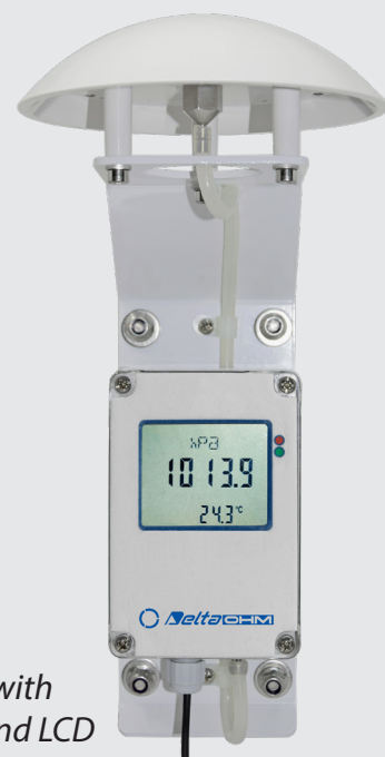
BAROsense with static port and LCD

Meteorological Applications Environmental Monitoring System Altitude applications Barometric pressure compensation in internal combustion engines Cleanrooms Testing of vehicle emissions