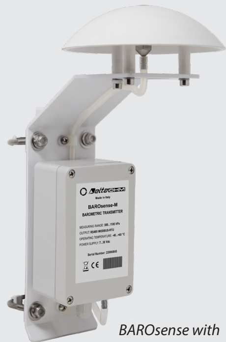
BAROsense with optional static port